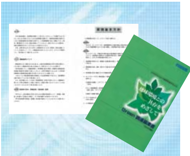
ROHM Green Procurement Criteria

We created our Green Procurement Criteria in FY 1997 and urged our suppliers to build environmental management systems. Since then we have asked them to comply with domestic and international environmental laws and regulations with regard to the use and the content of materials that generate an environmental burden, and we have also requested that they provide environmental data with documents such as environmental reports.