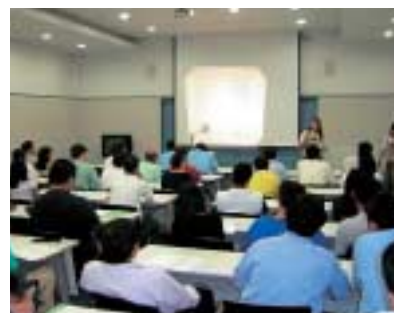
Green procurement orientation session in REPI (Philippines) for suppliers